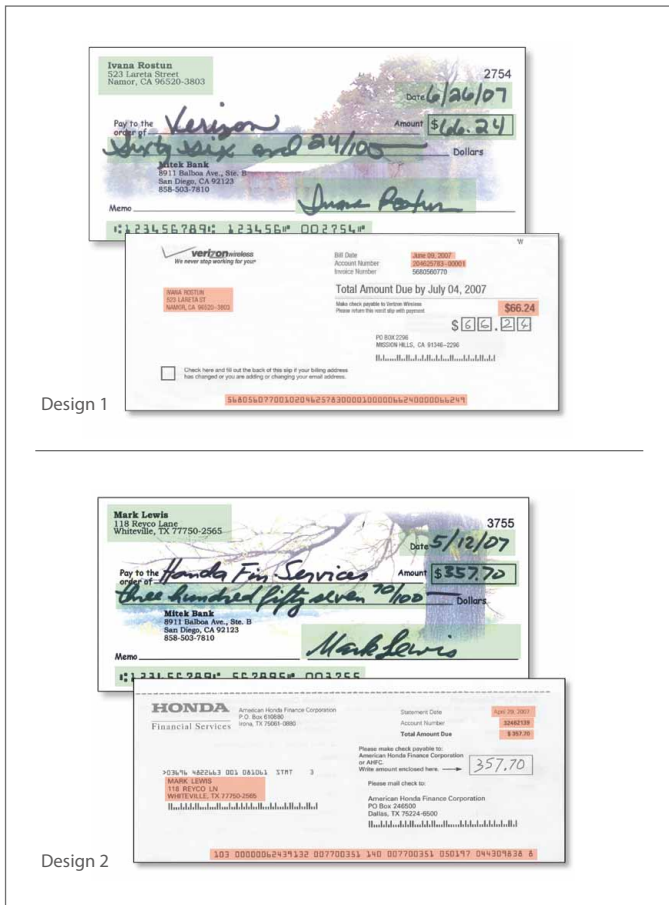
Mitek's exclusive Smart Coupon Recognition can extract data from different designs of coupons and checks in the same batch – without manual setup for each design.

Contact Mitek Systems at 858.503.7810 today to learn more about its range of ImageNet™ solutions.